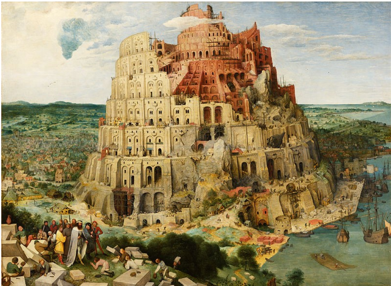
Pieter Bruegel the Elder, Tower of Babel . 1563. “So God scattered them from there over all the earth, and they stopped building the city.” Genesis 11: 8.