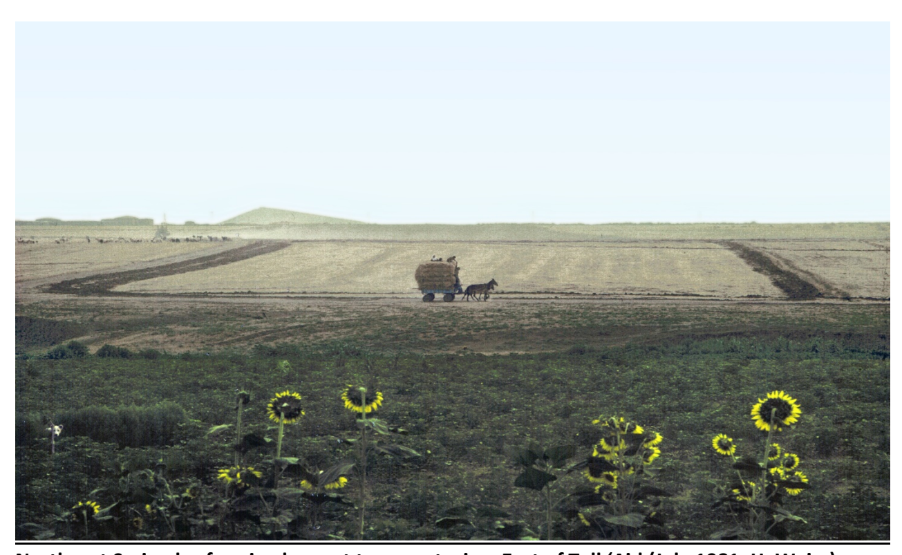
Northeast Syria, dry-farming harvest transport, view East of Tell 'Aid (July 1981, H. Weiss).

The workshop is being structured as (1) pre-workshop reading of invitees' suggested articles, (2) two or three workshop presentations each morning and afternoon, (3) each followed by Yale faculty participants' analysis and discussion, (4) with a concluding summary discussion of outstanding issues and research problems.